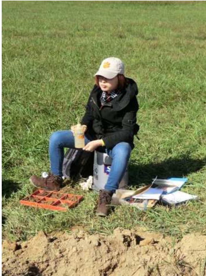
Fig. 8. Texture by feel during 2013 Southeastern Regional Soil Judging Competition in TN Tech University, TN.