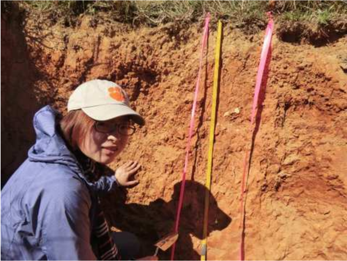
Fig. 6. Examining a no-pick zone of the practice soil profile during 2013 Southeastern Regional Soil Judging Competition in TN Tech University, TN.