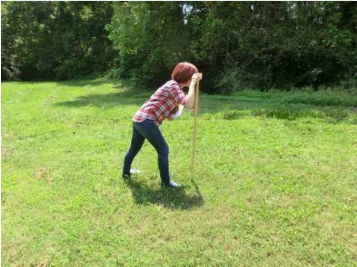
Fig. 7. Slope determination in the field.