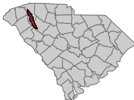
Figure 1. Location of Reedy River Watershed.

The Reedy River watershed encompasses 260 square miles and is situated in the Piedmont of South Carolina in the Saluda River Basin (Figure 1). The upper watershed lies entirely in Greenville County, is heavily urbanized, and includes all or parts of the Cities of Travelers Rest, Greenville, Simpsonville, Mauldin, and Fountain Inn.