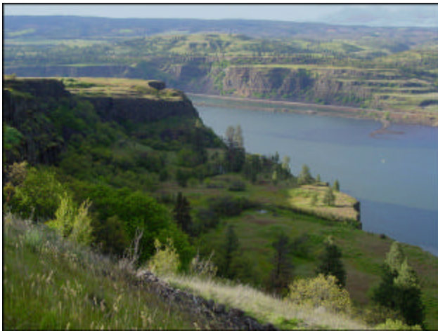
Columbia River Gorge