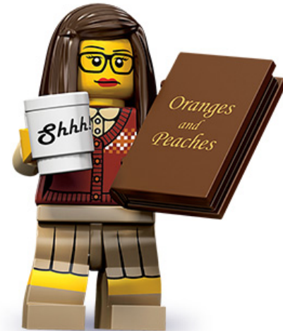
Image courtesy Lego http://minifigures.lego.com/en-us/Bios/Librarian.aspx