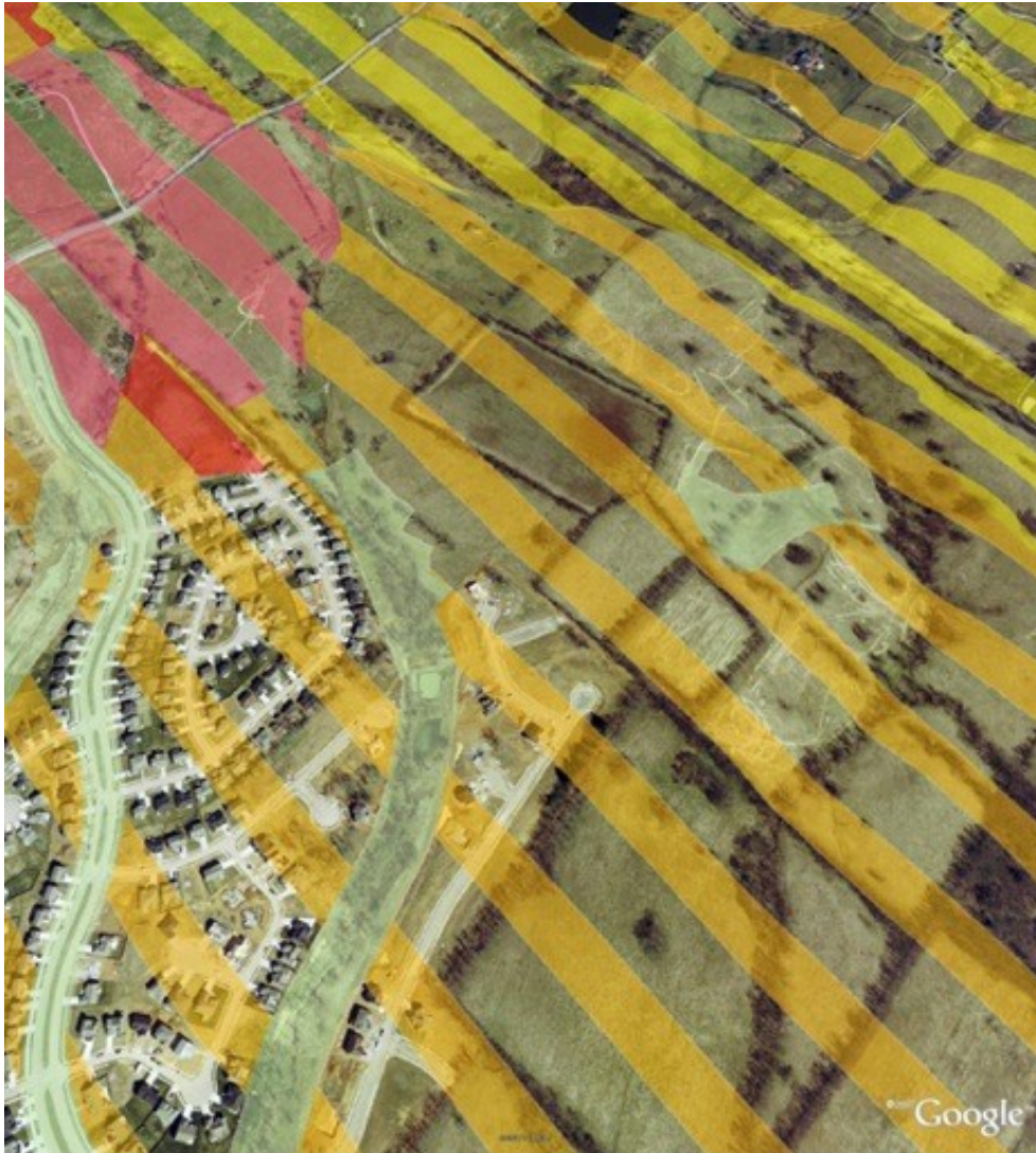
Figure 1. Semi-Transparent Land Use Plan (legend on-line at < http://sites.google.com/site/joegepaper/Home/land-use-plan---descriptions >)

The analysis presented in Figure 2 depicts the suitability ratings for dwellings without basements for the same tract of land. (The legend can be found on-line at < http://community.ca.uky.edu/LandUse/limitations.png >.) The FEMA 100-year flood map are also overlain (black lines). It is apparent that houses have been built in areas that are very limited for dwellings without basements (i.e., the red areas) according to the soil survey information. Potential problems (e.g., foundation failure) for homeowners could be averted if suitability maps were consulted in the future as potential residential development areas (e.g., yellow and orange striped areas in Figure 1) were considered more extensively during the planning process. Soil survey-derived land use information was intended for course scale (generalized) planning (Soil Survey Staff, 1993). Additional field confirmation is required for detailed