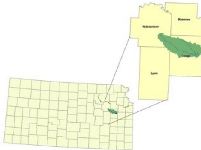
Figure 1. Pomona Lake Watershed Map