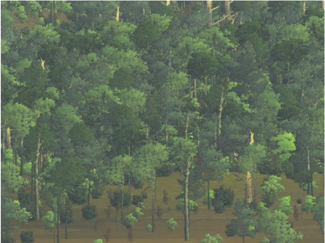
Figure 5. Visualization of ridge top forest stand 2 years after low severity fire at the Jocassee Gorges characterized by an increase in snag density/canopy gaps as a result of delayed tree mortality and regeneration of the shrub layer.