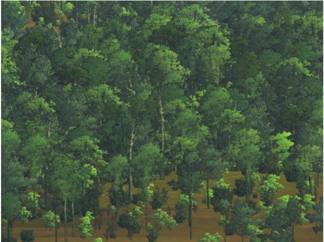
Figure 3. Visualization of typical present-day ridge top forest stand at The Jocassee Gorges characterized by a

The results of this section will be expressed as figures produced via visualization software. The utility of the software will be discussed in the following chapter.