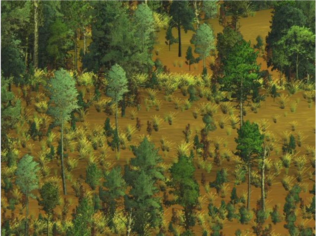
Figure 6. Visualization of long term fire management (Initial high severity fire followed with maintenance of frequent (2 year cycle) low severity fires) of ridge-tops at the Jocassee Gorges characterized by a drastic reduction of hardwood occupancy with an absence of mid-story and moderately dense to dense grass/shrub layer (Image adapted from Brose and Waldrop 2006). Habitats of this type in the SC Mountains are expected to support such species as bachman's sparrows ( Aimophila aestivalis ), bobwhite quail ( Colinus virginianus ), prairie warblers ( Dendroica discolor ), ruffed grouse ( Bonasa umbellus ) and potentially red-cockaded woodpeckers ( Picoides borealis ) among many others.