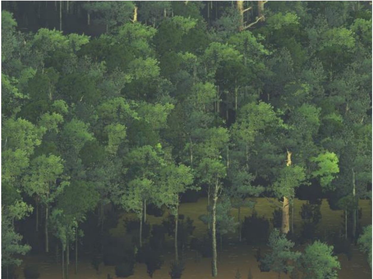
Figure 4. 4. Visualization of ridge top forest stand immediately following low severity fire at the Jocassee Gorges characterized by newly created snags and blackened images representing the impact of low-severity fire on the shrub layer .