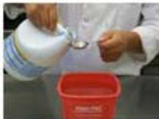
1 cucharada de desinfectante por cada galon de agua tibia