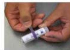
Mire si la concentracion es adecuada