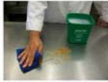
Limpie las superficies sucias con la mezcla detergente