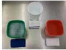
Prepare mezclas para limpiar y desinfectar