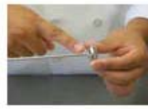
Adjuste hasta que indique 32°F