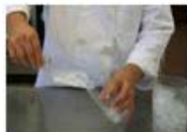
Añadir hielo limpio en un vaso