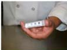
Use tiras de pH para medir la concentracion