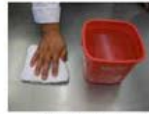
Esterilice con la mezcla desinfectante