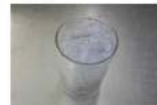
Espere dos minutos