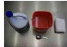
Desinfectante, agua, cuchara medidora