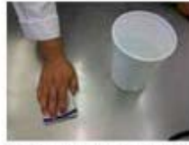
Enjuague la superficie con agua limpia