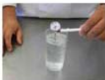
Mantenga el termometro en el agua helada