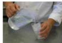
Añadir agua limpia al vaso