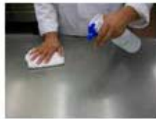
Una botella "spray" o aerosol puede ser usada

IOWA STATE UNIVERSITY University Extension