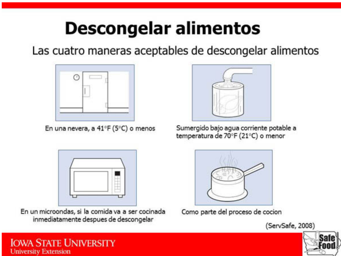
Figure 1. Handouts of Training Materials

All participants received a $10 gift card for groceries, a food thermometer, chlorine sanitizer strips, and handouts of training materials (Figure 1) as incentives for participation. The research protocol was reviewed and approved by the university's Institutional Review Board for Human Subjects prior to data collection. All participants provided informed consent prior to participation in the study.