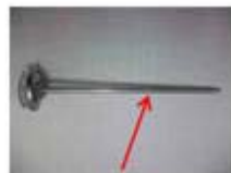
Inserte el area sensoria en el agua