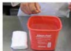
Insertar la tira pH en la mezcla desinfectante