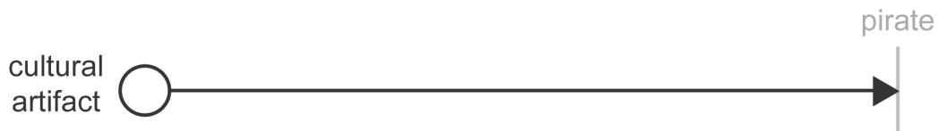
Figure 1 A "pirate" model of media consumption

pastiche has become a mainstream necessity as film reboots, music samples, and zombified genre rewrites color so much of our popular media. As culture has grown increasingly gratuitous in its borrowing, we have seen the pejorative connotations attached to media piracy in the Napster era fade. Though I would argue upfront notions of artistic piracy are more prevalent today via digital means in archiving and distributing cultural artifacts, piracy's OED definition as "the unauthorized use or reproduction of another's work" has really not grown to reflect its business as usual employment in popular writing. Sure there is a nod to modern copyright law, but in a digital authoring landscape piqued by remix and sampling, what really constitutes another's work? Furthermore, modern media piracy suggests a system defined more by consumption than production. The text starts somewhere else and ends with the pirate (Figure 1). While this model surely describes the behavior of those