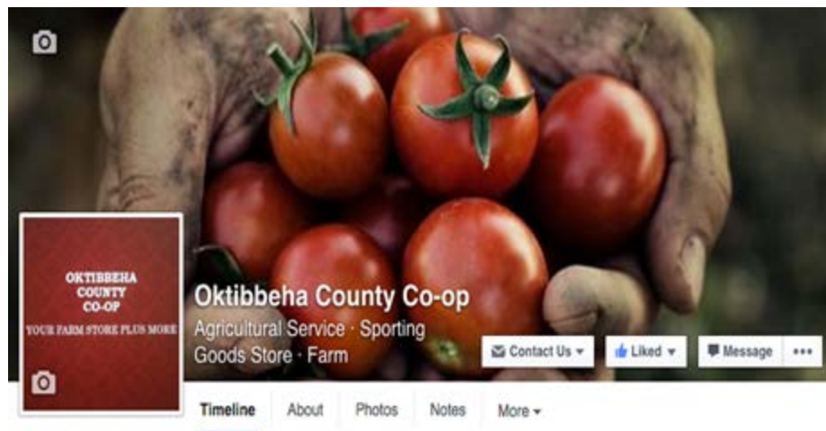
Figure 2 illustrates the contest conducted on the co-op's Facebook page July 4, 2015. The contest asked fans to "like and comment" on a post to be entered into a drawing to win an All-American Fish Cooking Kit, a $60 dollar value. The contest was from Wednesday, June 29, to Friday, July 3. The post was "boosted," meaning that we opted to have this post served to the fans of the page and their friends, a form of paid advertisement available to Facebook pages. The cost for this boosted post was approximately $45 dollars. The rules governing all contests were placed in a note on the page.