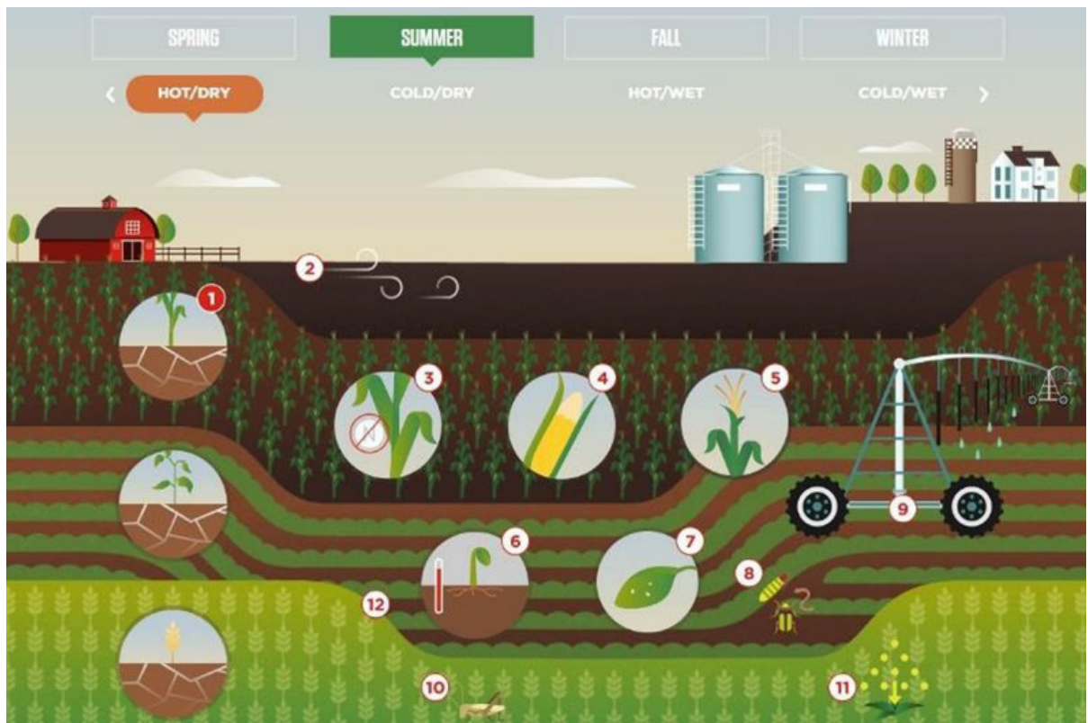
Figure 2. Cropping scenarios and impacts.