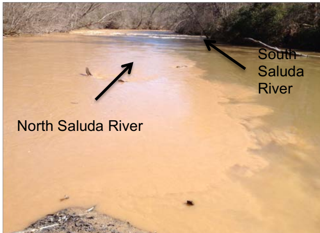
Figure 2. North-South Saluda Rivers Confluence

Cost effective and sustainable watershed-based solutions are needed for long-term erosion prevention and sediment control. Strategies to minimize soil loss from the watershed will help protect drinking water sources, improve river and lake water quality, restore aquatic habitat conditions, and enhance recreational experiences for property owners and the public.