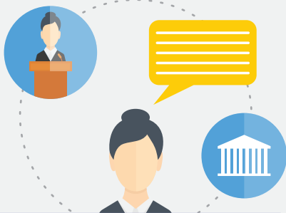
JUSTICE RUTH BADER GINSBURG

Some people think fair use is a minor exception or a marginal carve-out from the expansive protection for authors, but fair use is a fundamental right .