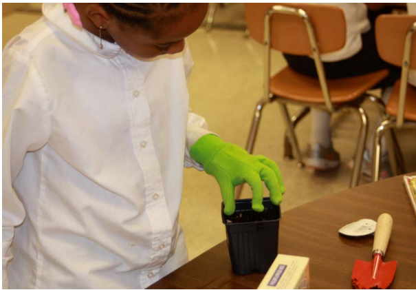
Figure 3. Victory is planting a new seed because her previous seed did not germinate.

CQ: You like that one? Why do you like that one?