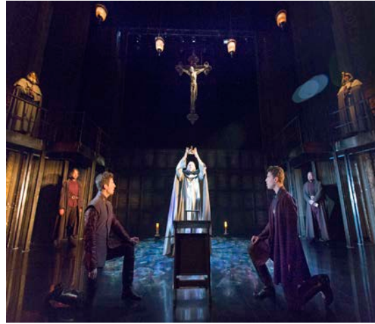
Figure 2: Jasper Britton as Henry IV (center) in 1 Henry IV.

The tone changed quickly from somber to lively with a telling juxtaposition: immediately after we saw the troubled Henry IV at church, a bed slid down stage with someone having vigorous sex under the covers. Out emerged two prostitutes and Prince Hal (Alex Hassell), followed by a fully clothed Falstaff (Antony Sher). Something similar happened later when Hotspur (Matthew Needham) stood stoically on stage a few extra minutes while the scene changed from a wartime sendoff to a raucous